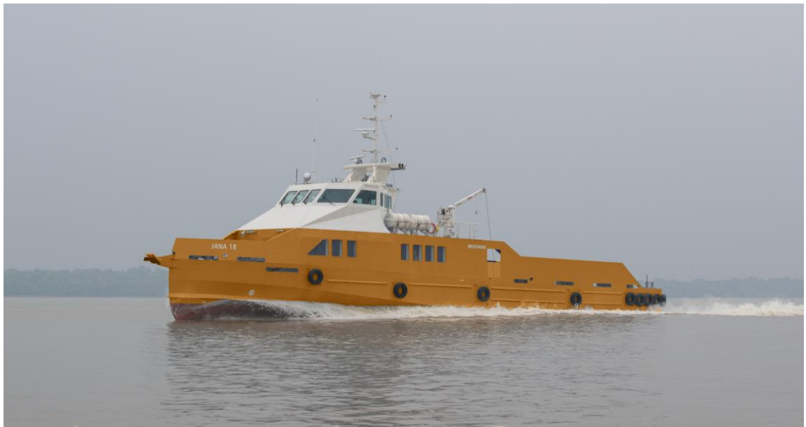
FPSV 41P: 41 m Fast Personnel and Supply Vessel / fixed pitch propellers

Six months after the delivery of 41m FPSV “JANA 17”, JANA MARINE, a Saudi Arabian provider of best in class integrated marine services to Offshore Oil&Gas Industry, renews its trust in PIRIOU by taking delivery of her sister ship “JANA 18” .