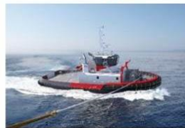
OST 32 E