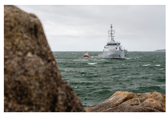
Cayor on arrival in Concarneau